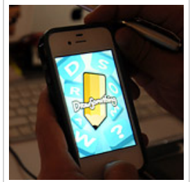
A Popular App Changes a Struggling Start-Up