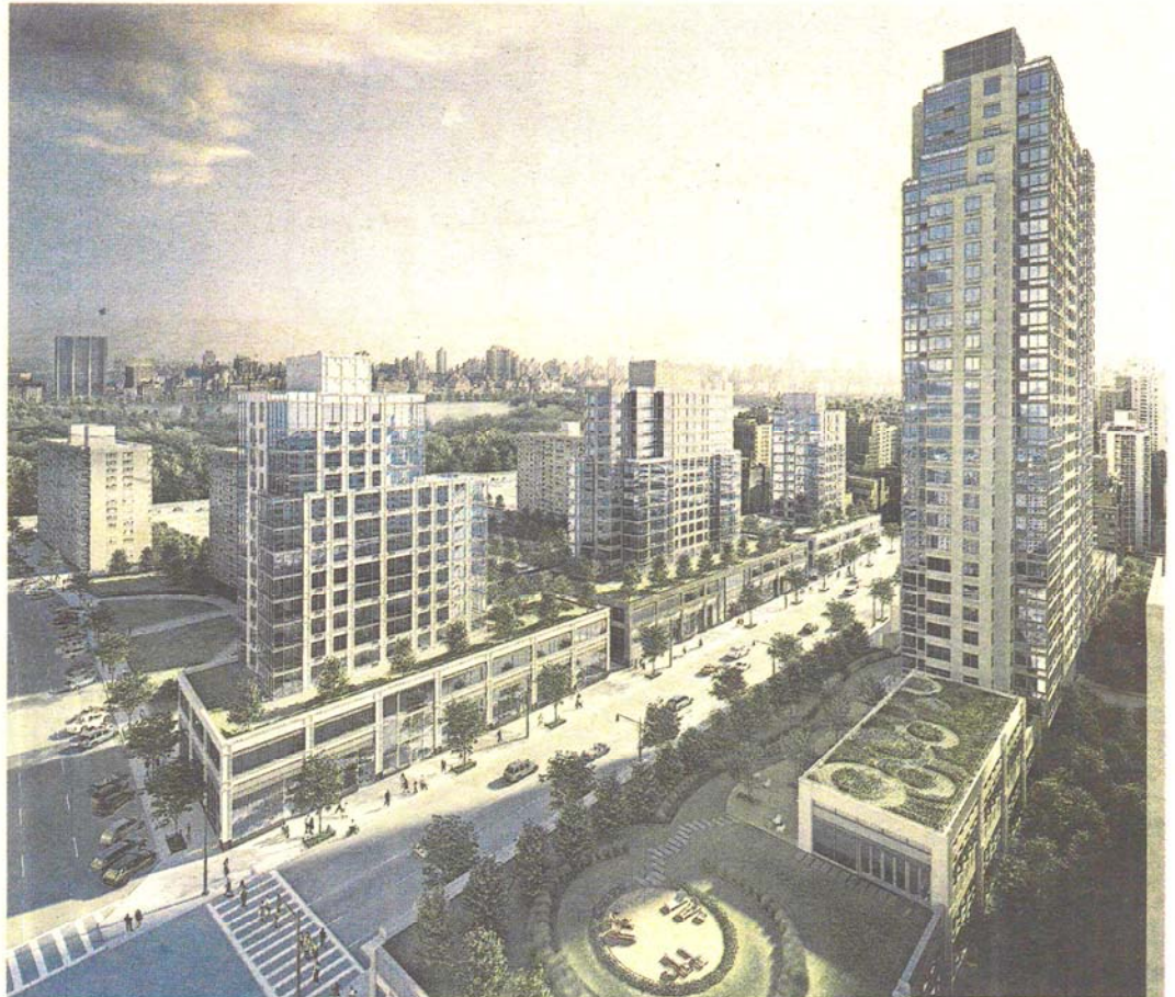
View towards Central Park From 808 Amsterdam

D espite the recession—or maybe because of it—the rental market in New York City is busy. Because of the loss of job security and the plunge in the economy, people are choosing to rent instead of buy their homes. Responding to this trend, some developers have even decided to change their new condominium buildings to rentals in order to meet the needs of today's market.