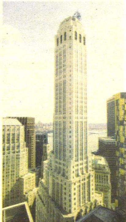
The 20 Exchange Street tower.

Residences have soaring 11-foot ceilings, kitchens with state-of-the-art appliances and marble countertops, hardwood floors, and bathrooms with marble floors and custom sinks and vanities.