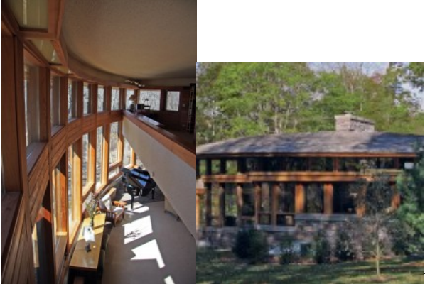
$1.5 Million Renovation Underscores Home's Distinctive Pedigree